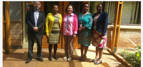
Meet our new Nairobi-based CBI trainers!

Competency-based Interviewing training is essential to ensure our selection processes will be as fair and un-biased as possible across the entire Secretariat. With this in mind, a group of staff members from UNON and UNSOS successfully trained in early July to become internal facilitators for the learning programme on Competency Based Interviewing for Panel Members. "We, as trainers should understand what the competencies mean in the UN context to do the interview practice well", one of the participants of the TTT explained. That is why participants worked hard to study the content, practice the exercises and hone facilitation skills to deliver CBI based on the high standards of the course. We welcome them into our community of trainers and wish them fun and success facilitating the programme!