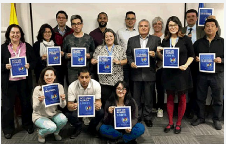
Colombia: UN for All reached 200 staff in one week

In the past 3 months alone, workshops have been held in Nairobi, Quito, Kigali, Lomé, Port Moresby, Bogotá, Belize City and Santo Domingo for inter-agency participants. Within this time frame, train-the-trainer sessions have been held in Bonn, Geneva, Port of Spain and New York with great success, thus creating a group of engaged multipliers.