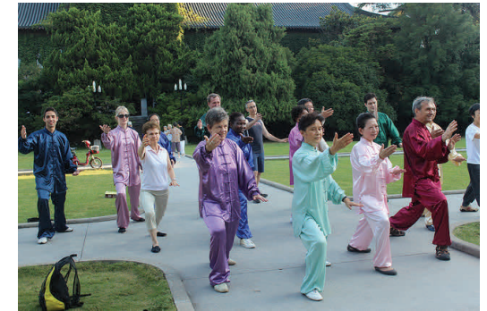
Our students in Nanjing

Chinese Refresher LMS-1151-11 M/W/Th, 2:00-3:00pm, 18 Apr-7 July in Room TBA